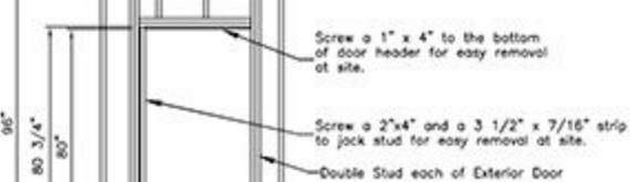
Framing for Exterior Door "A"