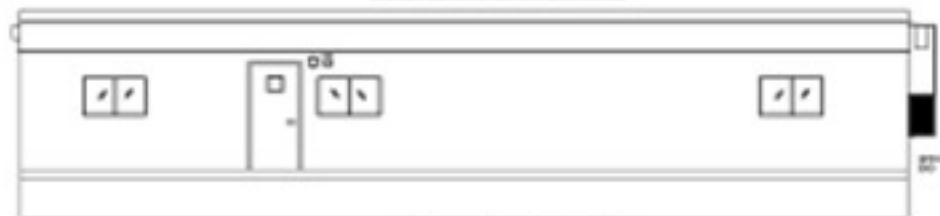
CURB SIDE ELEVATION