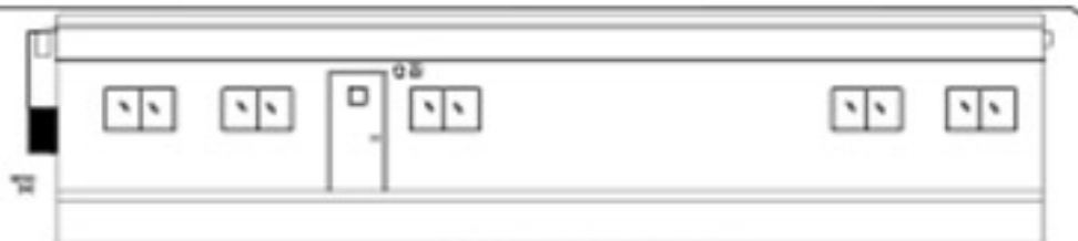
ROAD SIDE ELEVATION

LET'S WORK TOGETHER TO MAKE YOUR DREAMS A REALITY.